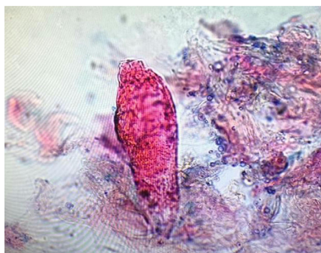
Fig 2. Skin scraping revealed Demodex folliculorum mites.