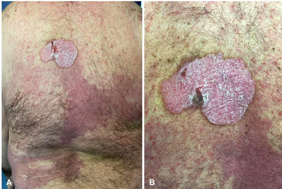
Fig 1. A , Clinical presentation of a solitary plaque located on the back in continuity with a giant vascular malformation. B , A close-up view of the lesion highlights the sharply defined border and a verrucous, scaly, and erythematous epidermal surface.